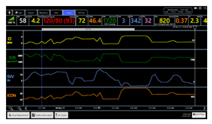
Various screens available including Trend View