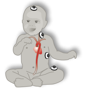
Sensor placement for small children and neonates