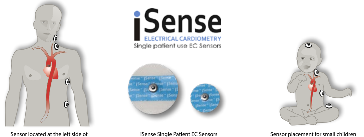
Sensor located at the left side of neck and thorax

Electrical Cardiometry<sup>™</sup> is a method for the non-invasive determination of stroke volume (SV), cardiac output (CO), and other hemodynamic parameters in adults, children, and neonates. Electrical Cardiometry has been validated against "gold standard" methods such as thermodilution and is a proprietary method patented by Osypka Medical.